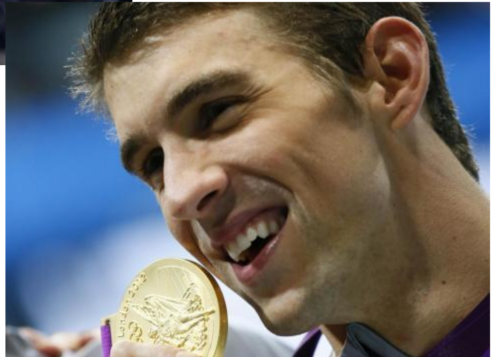
Michael Phelps– “Greatest Olympian”