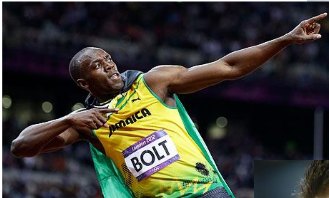
Usain Bolt – “Legend”