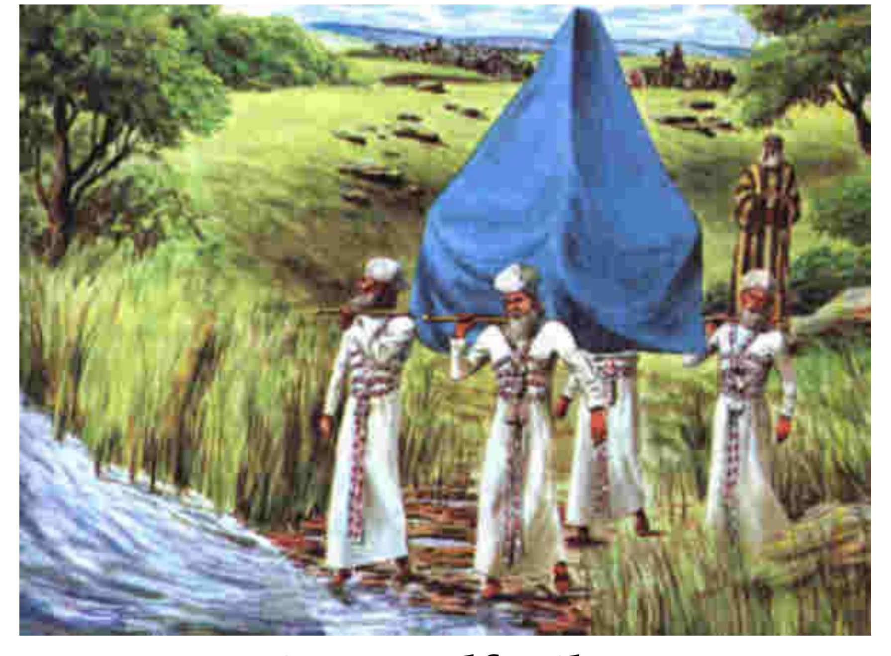
Keeping a Half Mile Away